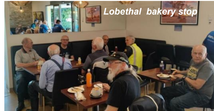
Lobethal bakery stop

The Weekend and Mid-Week Ride reports have been edited for space. The full articles can be read on