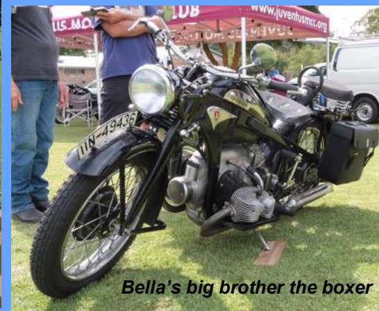
Bella's big brother the boxer