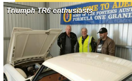
Triumph TR6 enthusiasts