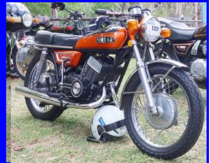
> Ron's 1971 Yamaha R5 350