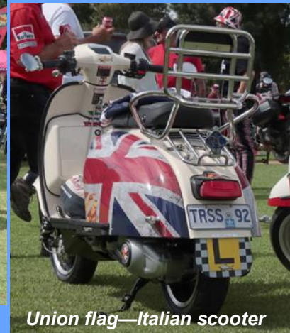
Union flag—Italian scooter