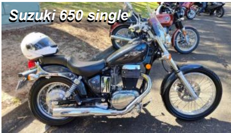
Suzuki 650 single