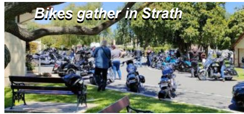
Bikes gather in Strath