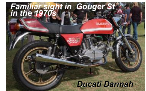
Familiar sight in Gouger St in the 1970s