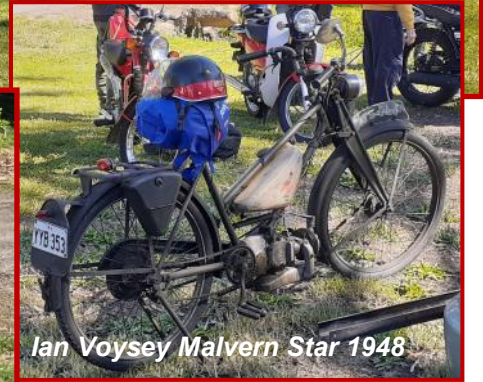
Ian Voysey Malvern Star 1948

The riders left around 10:30am and rode across the Hindmarsh Island Bridge and around the island stopping briefly to view the Murray Mouth. We broke for lunch at the Islander Tavern.