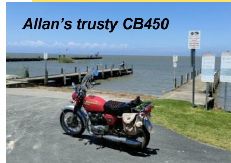
Allan's trusty CB450