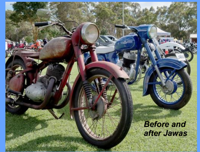
Before and after Jawas