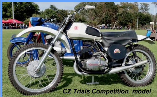
CZ Trials Competition model