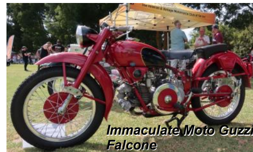
Immaculate Moto Guzzi Falcone

Lucky Bastard Brett Mitchell (very lucky bastard—took home 2 trophies)