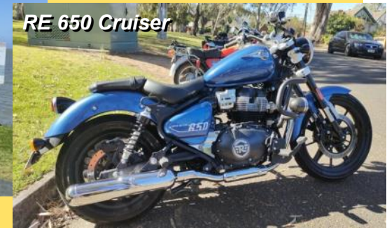
RE 650 Cruiser