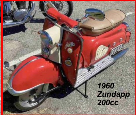
1960 Zundapp 200cc