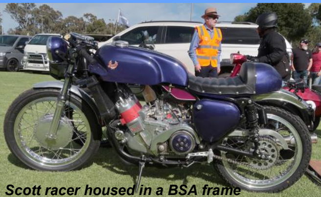
Scott racer housed in a BSA frame