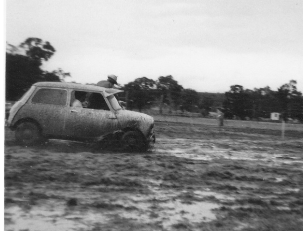
Right: A very muddy Morris Cooper. I noted that the front-wheel-drive cars seemed to go very well in the muddy conditions.