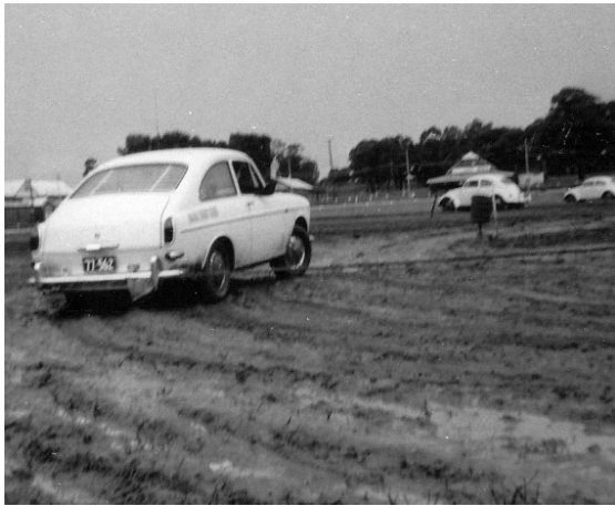
Left: There were only 3 VWs there; and they are all in this photo. Closest is a 1600TS.