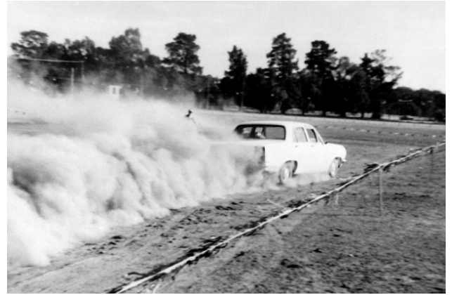
Right: Holden HR. It was very spectacular and kicked up a lot of dust throughout the day – firstly from wheelspin when taking off, then in spectacular cornering. I said that in the corners it understeered until the driver got the back sliding around; all of which churned up more dust.