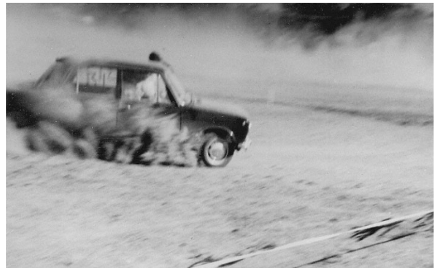
Left and Right: This Fiat 124 performed very well. I commented that it handled very well and seemed “very stable and controllable.” I commented that, as a car, it was probably the most impressive on the day – to me anyway. (Not in results particularly, just as a car and the way it handled the course).