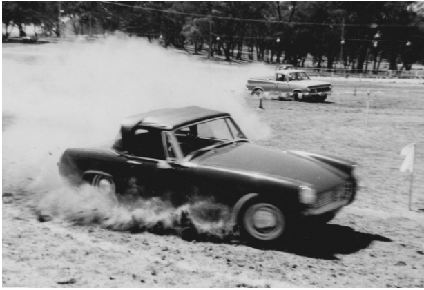
Left: Austin Healey Sprite. It had a modified engine, and “went like crazy.” I commented, “This took off and just rocketed down the course like a mad thing.” It beat the Holden in the background.