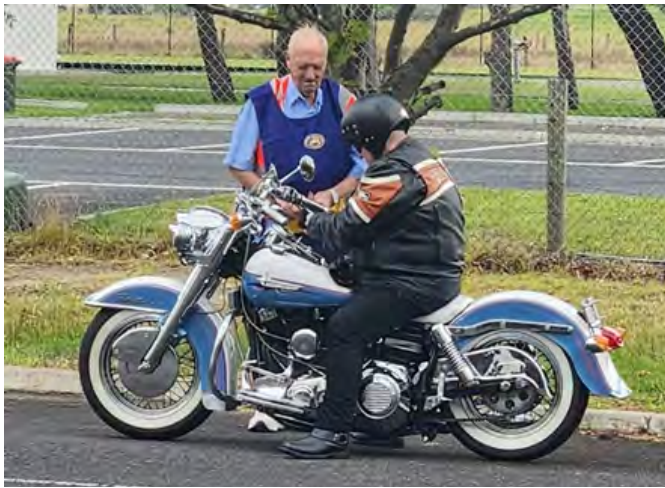
Best Motorcycle –